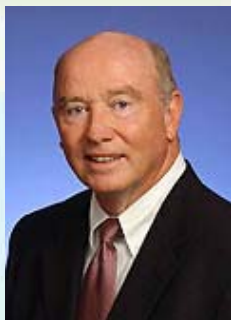
Jim Fyke, Commissioner

"Our department makes it a priority to recognize environmental stewardship"