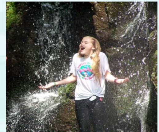
Great Smoky Mountains Institute at Tremont's educational programs raises awareness of Tennessee's natural resources.