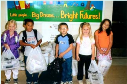
Huntingdon Primary School "Cash for Trash" - Carroll County