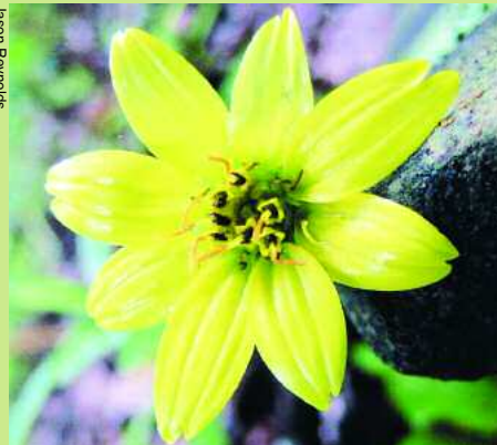
Cumberland Rosinweed is an endangered plant you might see as you hike on Buggytop Trail in the Carter Natural Area in South Cumberland State Park. Below: The entrance to South Cumberland State Park's Buggytop Cave in the Carter Natural Area.