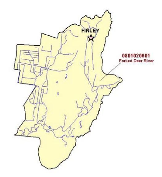
HUC-10 Subwatershed in the Forked Deer River Watershed.

Point and Nonpoint Sources are addressed in Chapter 4, which is organized by HUC-10 subwatersheds. This watershed is comprised of only one HUC 10 subwatershed. Maps illustrating the locations of STORET monitoring sites and USGS stream gauging stations are presented for the subwatershed.